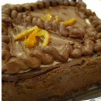
Chocolate Orange Cheesecake