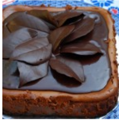
Coconut Cake, Cheesecake, and Chocolate