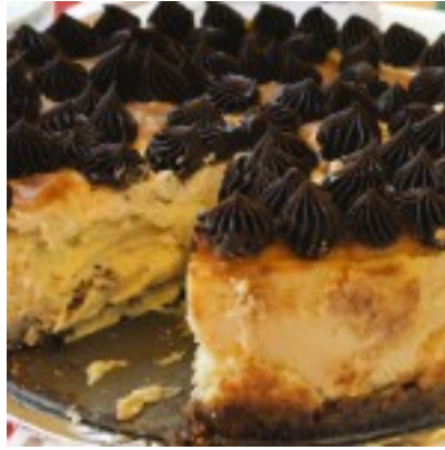
Caramel Cheesecake With Salted Caramel Chocolate Ganache