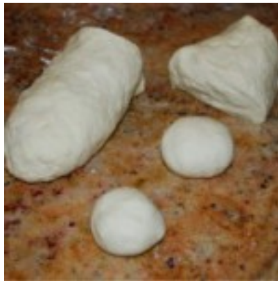
Boyos de Spinaca