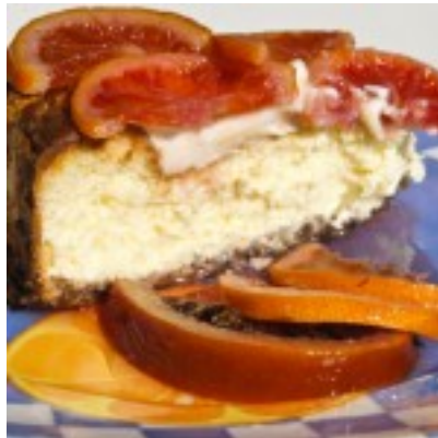
Blood Orange Cheesecake