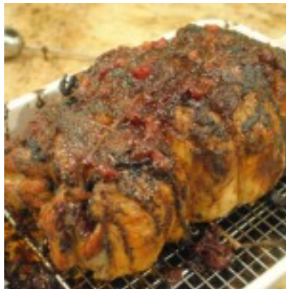
Boneless Turkey With Stuffing