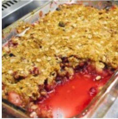
Cranberry, Pear, Apple Crisp