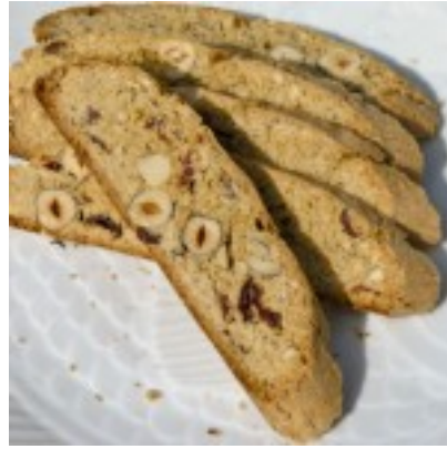
Hazelnut Biscotti with Dried Cranberries