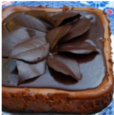
Coconut Cake, Cheesecake, and Chocolate