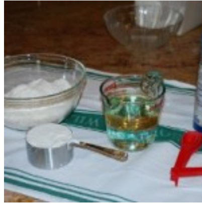
Pastelicos (meat and rice borekas)