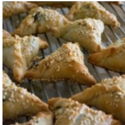
Pastelicos With Chicken