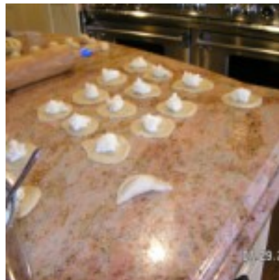
Borekas With Potato And Cheese