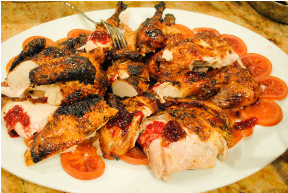
Mitzrayim Chicken With Blood Orange and Date Molasses

Where has the time gone? I have been cleaning up from Pesach this week, so many things need to be carefully packed away until next year, leftovers need to be dispatched, diets started anew, tablecloths cleaned and on and on. This Spring and Summer will be very eventful for our family, which means a lot of barbecues, brunches and celebratory meals. I will be posting some menus and recipes. In the meantime take a look and enjoy these pictures of our Pesach.