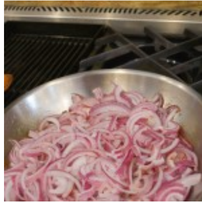
French Roast, Slow Cooked with Red Onion Confit