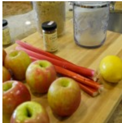
Apple Rhubarb Pie