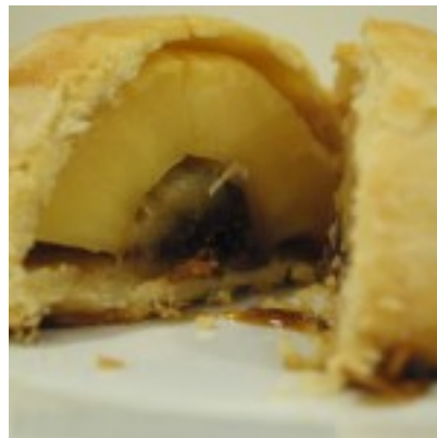
Pink Lady Apple Hives