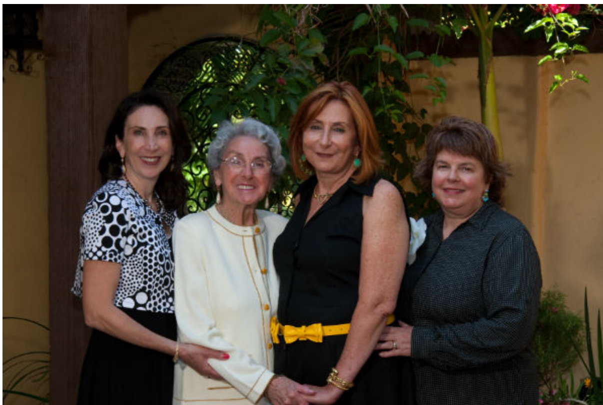
Capeloto Sisters with Nona at 90Serves 12 to 20