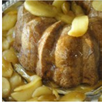
Apple Cake with Caramel